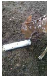
Foraging log feeder