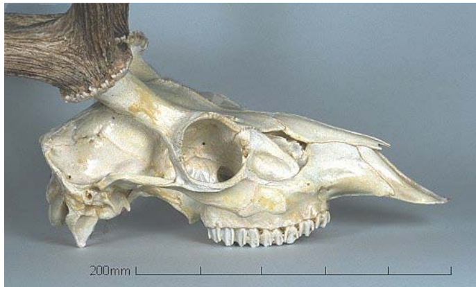
Axis Deer Skull, male, lateral view.

Axis deer was introduced to Australia in 1866, Texas in 1932 and Hawaii in 1950 (Graff) or in 1974 (Ables) and in all area has become hunted for game meat and as trophy hunts.