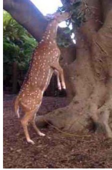
High hanging food