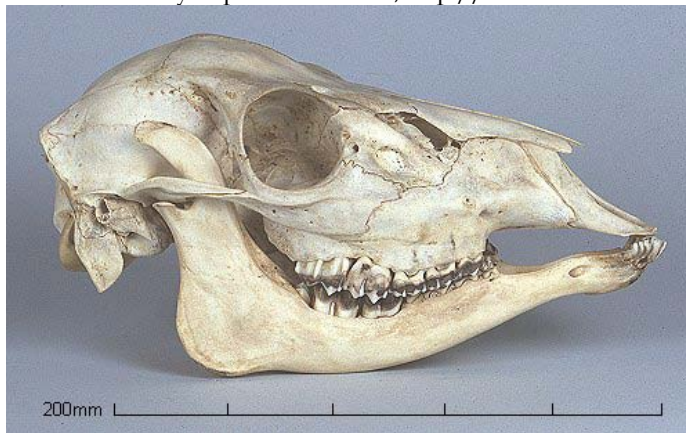
Axis Deer Skull, female, lateral view.