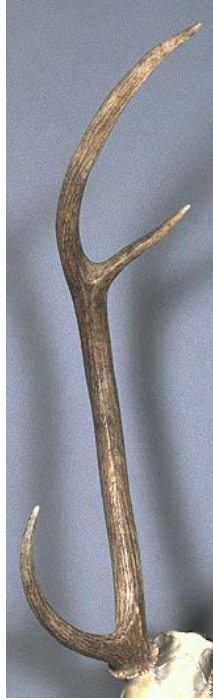
Antler of male in first image.